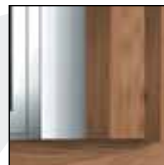
Interior Finishing Boards