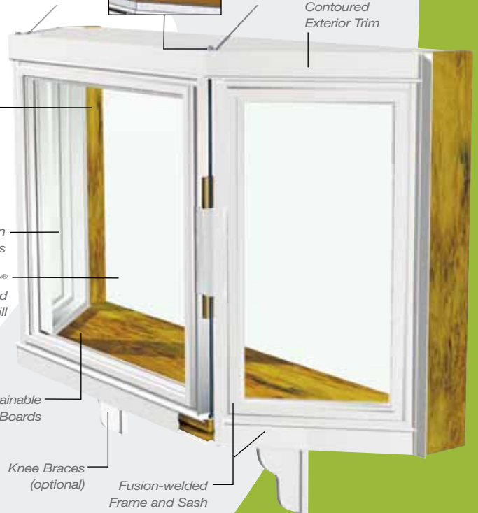
Fusion-welded Frame and Sash