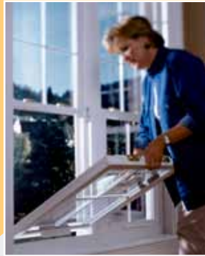
Double Hung windows tilt in for easy cleaning, while Casements crank out to a full 90 degrees and provide ample room on the left and right for easy maintenance from within the home.

Impressions® windows are backed by a Double-Lifetime Limited Warranty that covers vinyl, hardware, screens and glass units. In addition, all Simonton Impressions products include a 20-year accidental Glass Breakage Warranty and products with any of the Sensor Glass® packages carry a Lifetime Glass Breakage Warranty. See your Simonton Sales Representative for complete details.